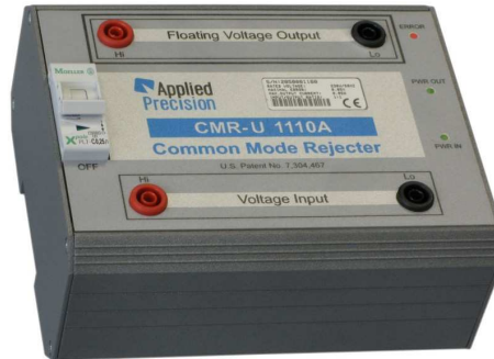
Precision Electronically Compensated Voltage Transformer CMR-U ™