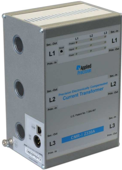
Precision Electronically Compensated Current Transformer CMR-I ™