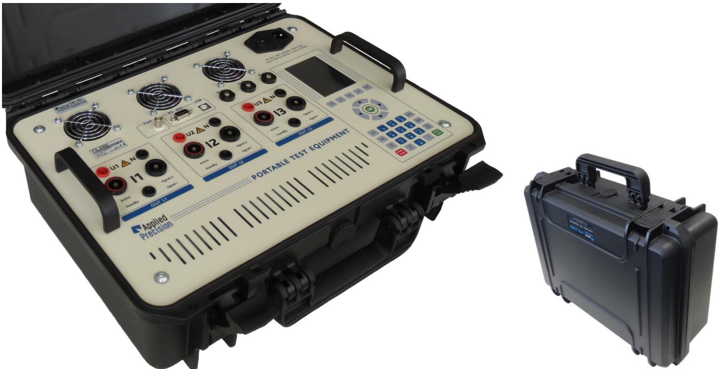
Portable Test Equipment

The Portable Test Equipment consists of an integrated current and voltage source and electronic reference standard of accuracy class 0.05% or 0.02%. Device is available in three-phase version PTE 2300 or single phase version PTE 2100.