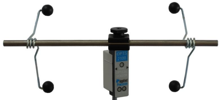
Optical Sensor OPTS 2100 with its Fixing Clamp OPFC 1000