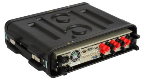
Transport Case RSTC 1000