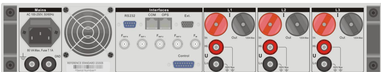
Rear panel of RS 2330