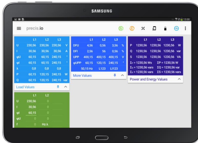
Application screen in tablet

It can show measured values, control meter error measurement and generation of signals (in PTE device).